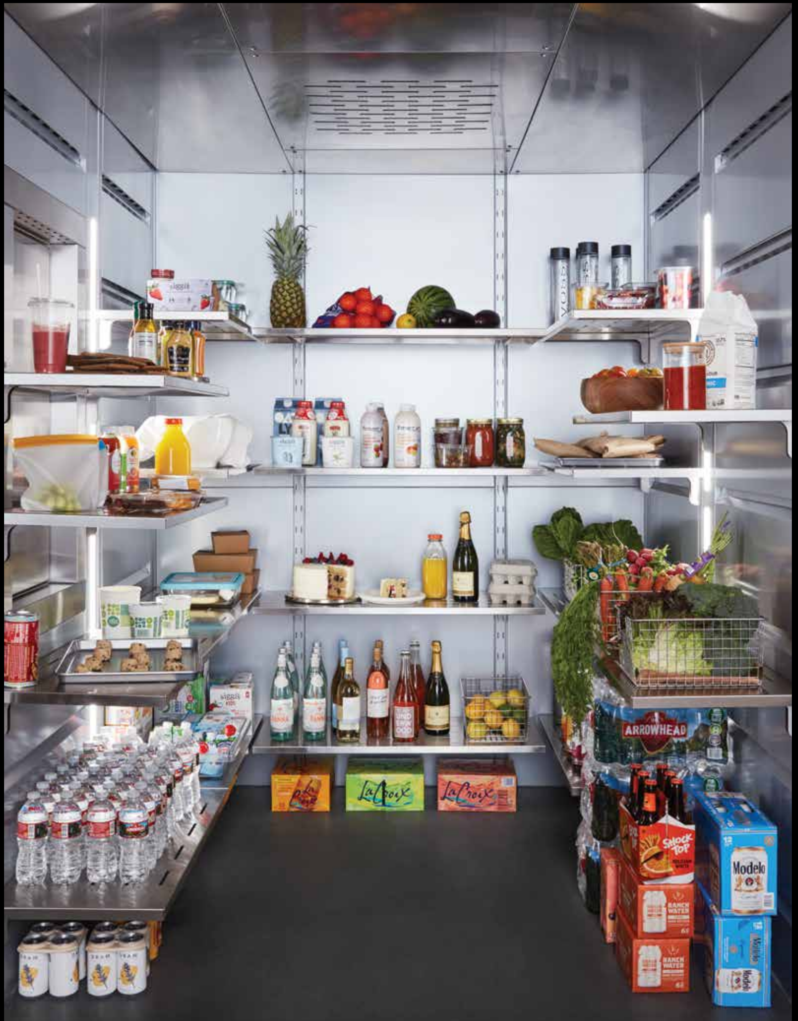
Shown: Ooldfusion All Refrigerator Walk-In Cold Pantry